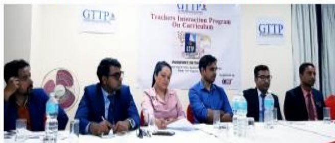
Tourism teachers in Nepal learn about the GTTP curriculum

At GTTP Nepal we have prioritised tourism education and literacy as one of the major tools to promote tourism. To help achieve our aims, we held a teachers' conference to educate our tourism teachers on the best way to deliver the GTTP curriculum Passport to the World effectively in the classroom. 18 teachers took part in the program, many of whom had previously been introduced to the curriculum by GTTP India. The teachers will be able to pass on their knowledge at our national level teacher training program.