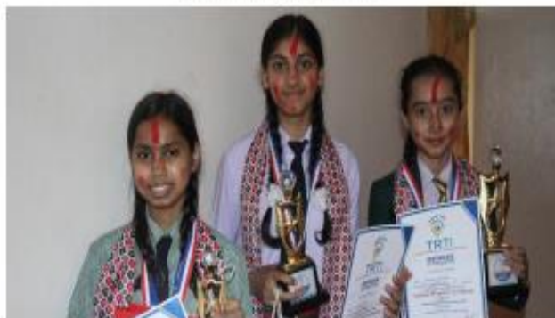
Winners of the inter schools tourism speech contest in Kathmandu Valley

At GTTP Nepal we have prioritised tourism education and literacy as one of the major tools to promote tourism. To help achieve our aims, we held a teachers' conference to educate our tourism teachers on the best way to deliver the GTTP curriculum Passport to the World effectively in the classroom. 18 teachers took part in the program, many of whom had previously been introduced to the curriculum by GTTP India. The teachers will be able to pass on their knowledge at our national level teacher training program.